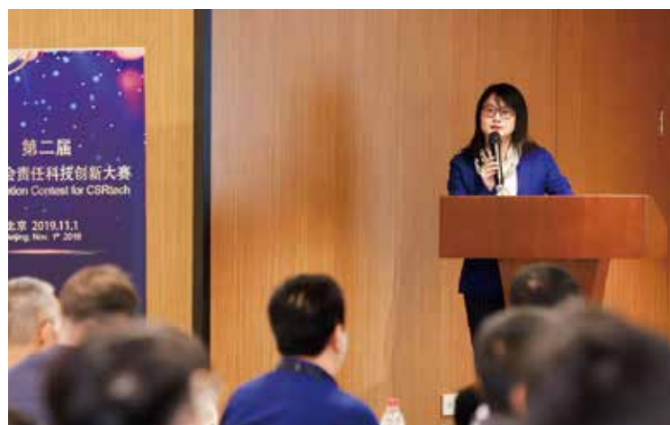
Keynote Speech at the Final

On November 1, 2019, as an innovation partner, ICCSD attended the final of the "2 nd Innovation Contest for CSRtech" jointly sponsored by France Telecom Orange, ZTE and Zhongguancun Inn Way. Stimulated and inspired by the United Nations Sustainable Development Goals (SDGs), the contest aims to look for innovative solutions to cope with challenges of enterprises' sustainable development and explore new models of value creation. Our representatives were invited to give a keynote speech on Social Responsibilities of Enterprises Contribute to Sustainable Development at the final.