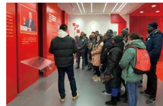
Zhongguancun Software Park

On the afternoon of 20 th December, the trainees came to Baitasi to learn about urban renewal experience in Beijing. After visiting the transformed courtyard project in the Baitasi area, they had a detailed understanding of the creative design concepts and sustainable transformation measures of each courtyard. The trainees expressed great enthusiasm for sustainable solutions that integrate traditional culture and modern elements in the area. The innovative practice of the Baitasi renewal project in exploring the old Hutong area also brought them more profound thinking.