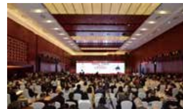
The scene of the opening ceremony.

In the governance process of Sunshine Community, the focus of the creative planning is not on space transformation, but on community system construction and community spirit cultivation. More community residents have been attracted to participate in community affairs through the planning and design of public space. Using creativity as a means has reshaped the community spirit and resolved the contradiction between population mobility & diversity and the lack of community cohesion.