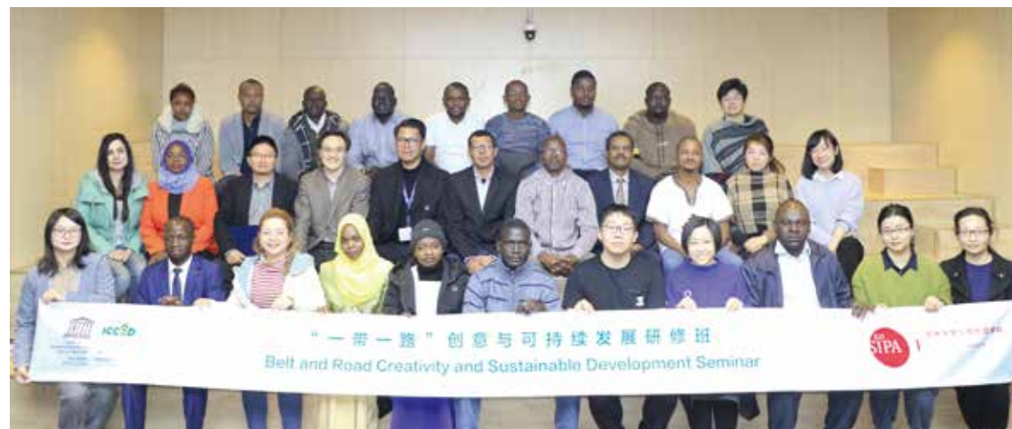
The ICCSO staff and all trainees

On December 18, 2019, the first Belt and Road Creativity and Sustainable Development Seminar was held at the Plaza of Design, Xicheng District, Beijing. More than 20 trainees from Asia and Africa participated in this training activity.