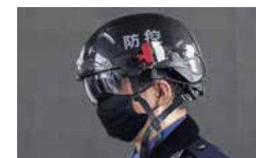
The policeman wears a smart non-sense body temperature test helmet.

they can complete the temperature measurement. In case of anyone with fever, the helmet will give an audible and visual alarm immediately. This "smart helmet N901" can detect the body temperature of multiple persons in the field of vision at the same time. It can also identify the QR code in real time and automatically record the personnel ID information. The helmet totally weighs less than 1,200g, so it is very convenient to wear without wiring. Since it adopts the aviation level heat dissipation technology and energy control technology, it can support the staff to work for 8 hours without overheating. In addition, it features strong anti-explosion ability, which can greatly reduce the electromagnetic radiation to human body. The staff wearing this helmet becomes a new "light cavalry" for epidemic prevention in special period.