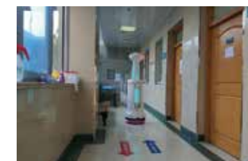
TMiRob robot is working.

In order to improve the hospital operations, reduce the burden on medical staff and lessen cross-infection, more and more intelligent robots such as disinfection robots, material distribution robots and ward service robots are applied in the anti-epidemic frontline. The disinfection robot can disinfect 360 degrees without dead corners, and can use the corresponding disinfection scheme according to the room temperature, humidity and other conditions. If there is someone in the room, hypochlorite plasma will be used for disinfection. If there is no one, ultraviolet + hydrogen peroxide scheme will be used for disinfection. The intelligent distribution robot can open and close doors, access to elevators and charge independently through intelligent scheduling. According to the needs of the hospital, it can deliver laboratory test sheets and drugs to the patients. In addition, it can serve meals, daily necessities and medical supplies to the isolation ward, so as to reduce the risk of cross-infection of the virus.