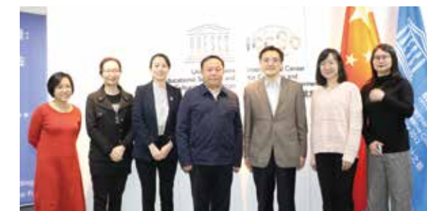
A delegation led by General Manager of Gehua Cultural Development Group visits the ICCSD ■