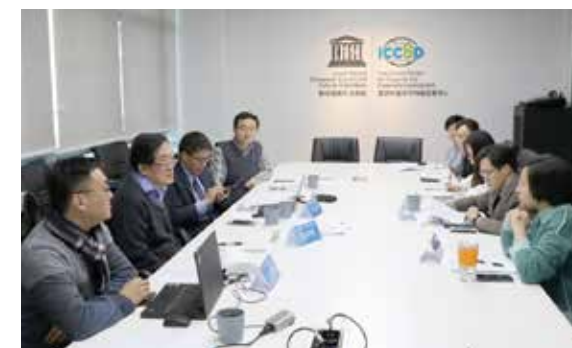
Scene of the Seminar