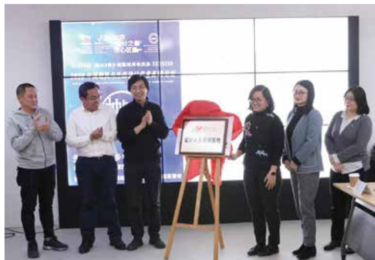
Scene of the opening ceremony of the "Rural Design" project ■

On December 24, 2019, Youcheng China Social Entrepreneur Foundation invited ICCSD as the co-sponsor of the "Rural Design" Project to jointly launch and integrate industry resources in the design and cultural sectors to deliver design-related intelligence and human resources to poor rural areas, and enhance the competitiveness of poverty-stricken products and services such as cultural tourism and economic industries in poor rural communities, thereby contributing to the country's rural revitalization strategy, and actively promoting the realization of the UN sustainable development goals with creativity.