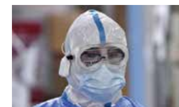
A medical worker wears graphene demisting phototherapy goggles.

In the anti-epidemic frontline, goggles have become an essential equipment for frontline medical staff. In order to solve the problem with goggle misting to affect the work of medical staff, many enterprises have developed graphene demisting phototherapy goggles, which can be worn continuously for 6 hours without misting. With the light transmittance and electric heating characteristics of functionalized graphene, graphene demisting phototherapy goggles can help effectively prevent misting and increase light transmittance, relieve eye fatigue, eliminate eye puffiness, prevent dry and sore eyes, relieve overwork, effectively guarantee the health of medical staff, and improve work efficiency.