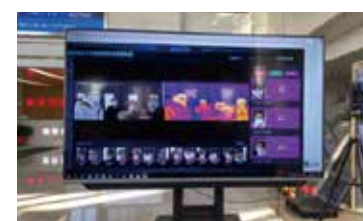
MEGVII AI temperature measurement system is put into use in Haidian Government Affairs Hall, Beijing.

public prevention and control of the epidemic.