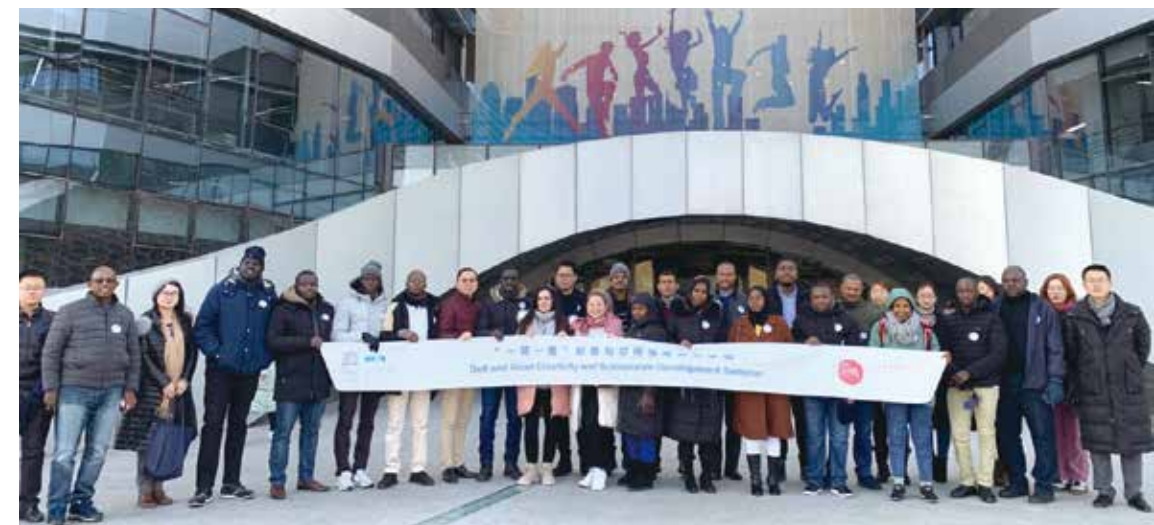
Zhongguancun Software Park

On the morning of 20 th December, the trainees went to Zhongguancun Software Park for a field visit of technological and creative development in Beijing, and learning about the development, industrial layout and innovative services of the Software Park. In the Park, the trainees felt the vitality of China’s technological innovation, came into contact with the development frontier of artificial intelligence and other industries, and communicated with the representatives on the park’s industrial layout, dual entrepreneurship, international cooperation, incubation network system and talent training, etc.