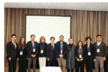
Guest speakers of Cultural Heritage Protection and Creative Design Forum